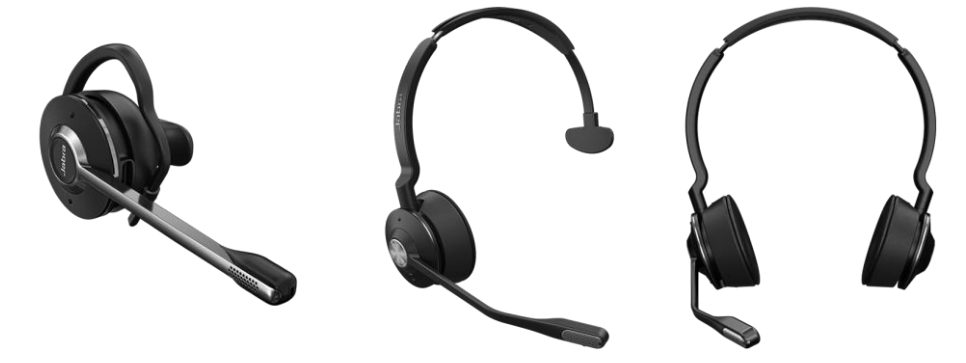
Figure 2 Convertible (left), Mono (middle) and Stereo (right) Headset

The Headset form factors are identical for models compatible with Jabra Engage 65 and Jabra Engage 75 but the software differs to handle the differences in the Base Station interfaces. There are three TOE Headset form factor variants: Convertible, Mono and Stereo. The variants differ in a way they are worn by the user. They are illustrated in Figure 3. Functionally each headset variant is identical and runs identical software. The difference is in form factor only.