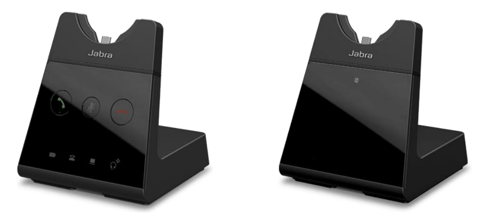
Figure 3 Jabra Engage 65 (left) and Jabra Engage 75 (right) Base Stations

The Headset form factors are identical for models compatible with Jabra Engage 65 and Jabra Engage 75 but the software differs to handle the differences in the Base Station interfaces. There are three TOE Headset form factor variants: Convertible, Mono and Stereo. The variants differ in a way they are worn by the user. They are illustrated in Figure 3. Functionally each headset variant is identical and runs identical software. The difference is in form factor only.